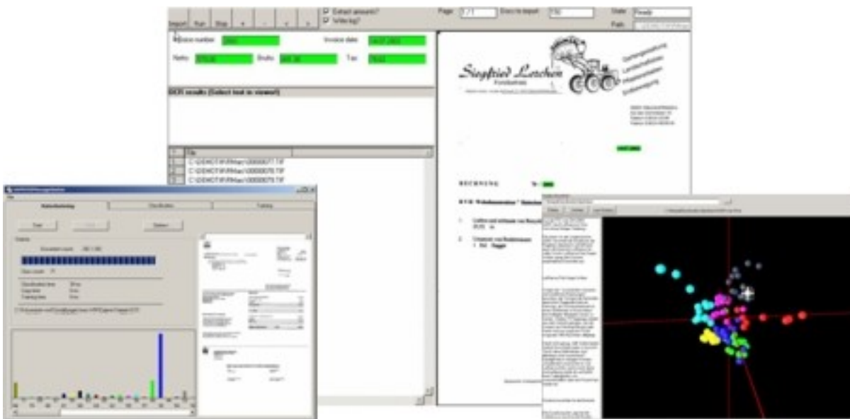
Useful intuitive interface for LayoutClassification and ContentClassification

IntelligentExtraction works with paper documents as well as with e-mails and Office files.